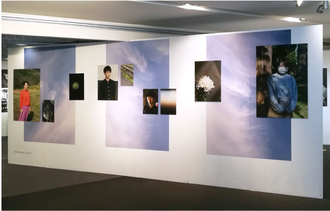
Festival Transphotographiques, September 2021, Lille, France 3 wallpaper prints, 9 fine art prints on aluminium, total dimension 200x570 cm