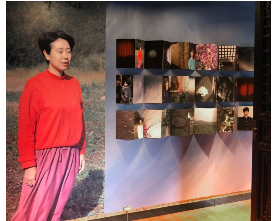
Dali International Photography Exhibition Festival, La Grande France, Dali, China, august 2019 3 wallpaper prints, 3 leporello on the wall, 200x500 cm

2 https://drive.google.com/file/d/1P7BKyn7VzKpA0QqKd9e-STF0v3TrCvM/view