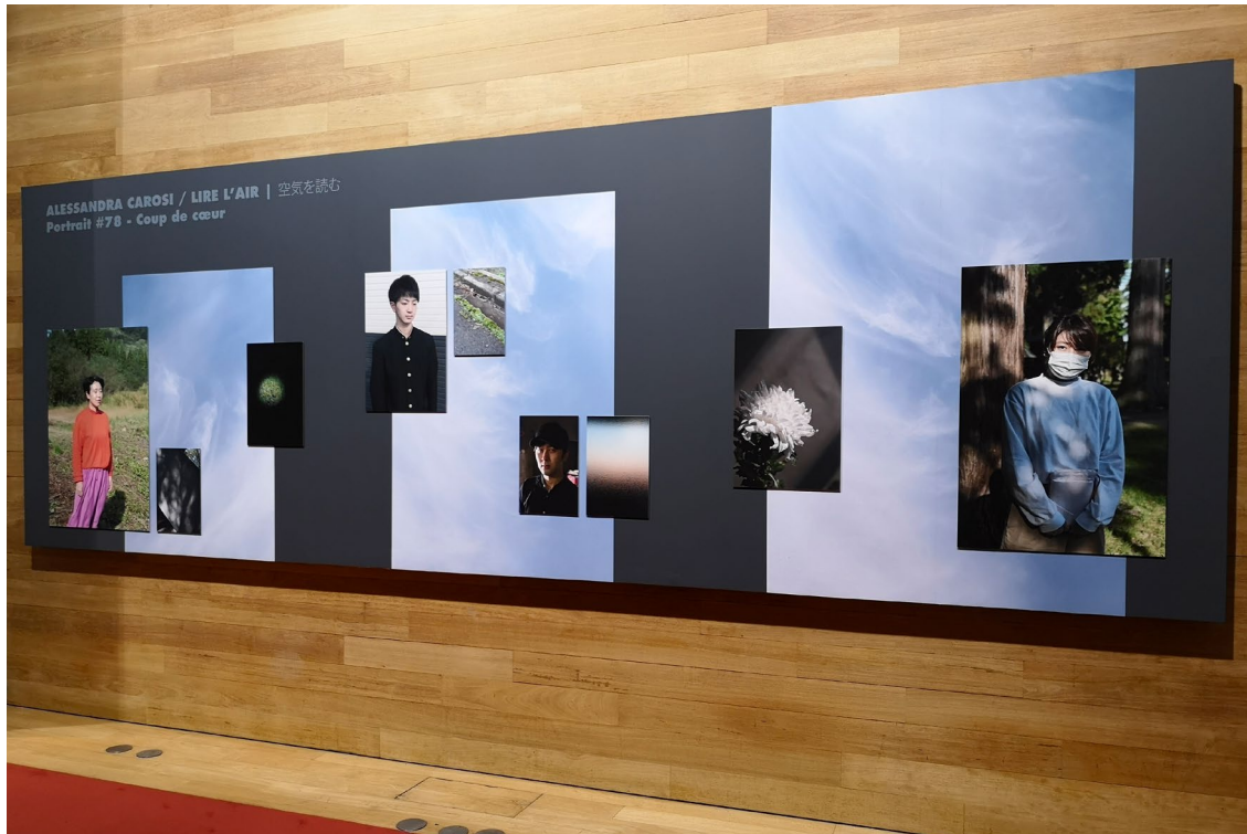
La Bourse du Talent, Bibliothèque National de France, BnF, december 2019, Paris, France 3 wallpaper prints, 9 fine art prints on aluminium of different dimensions, total dimension 180x600 cm