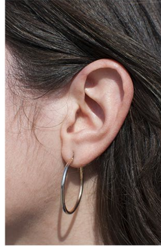
Some images from the project: Tripthyc (The Choleric temperament)