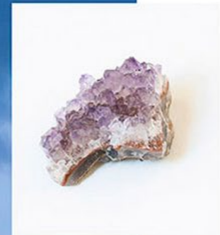
Triphthyc (The Sanguine temperament)