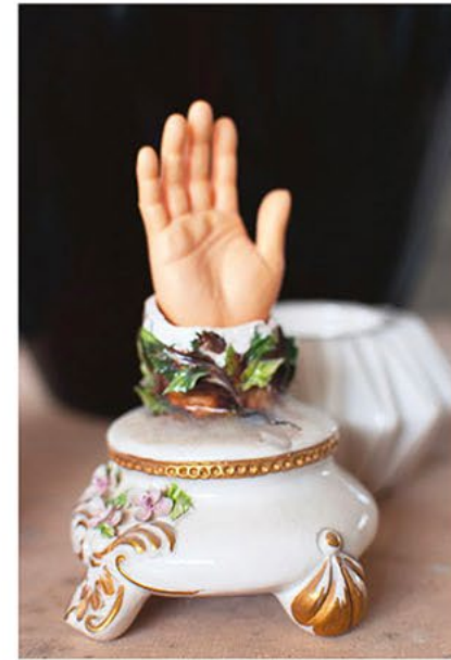
Diphthyc (The Sanguine temperament)