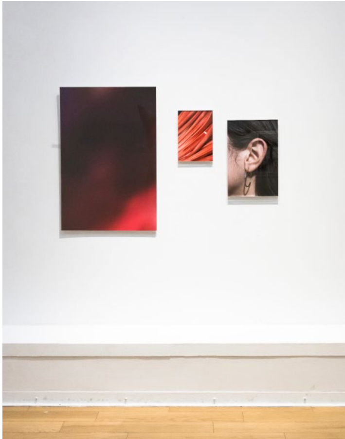
from the series Ruota, Triptych from the Choleric temperament Fondazione Fabbri, Pieve di Soligo, Italy, november 2017. Fine art print on cotton paper, structure frame in pmma, total dimension 150x100 cm (67x200, 24x35 e 35x53cm).