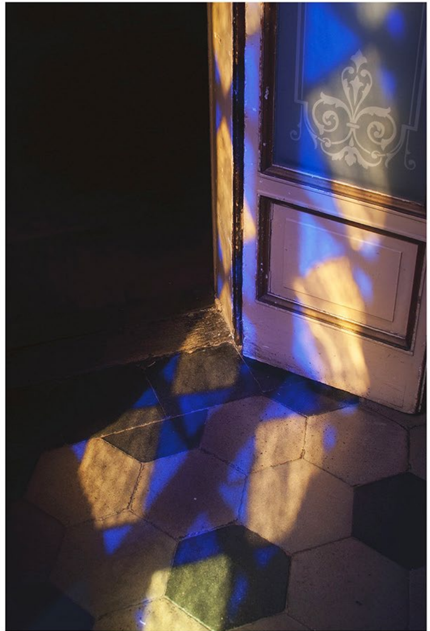
Dipthyc (The Melancholic temperament)