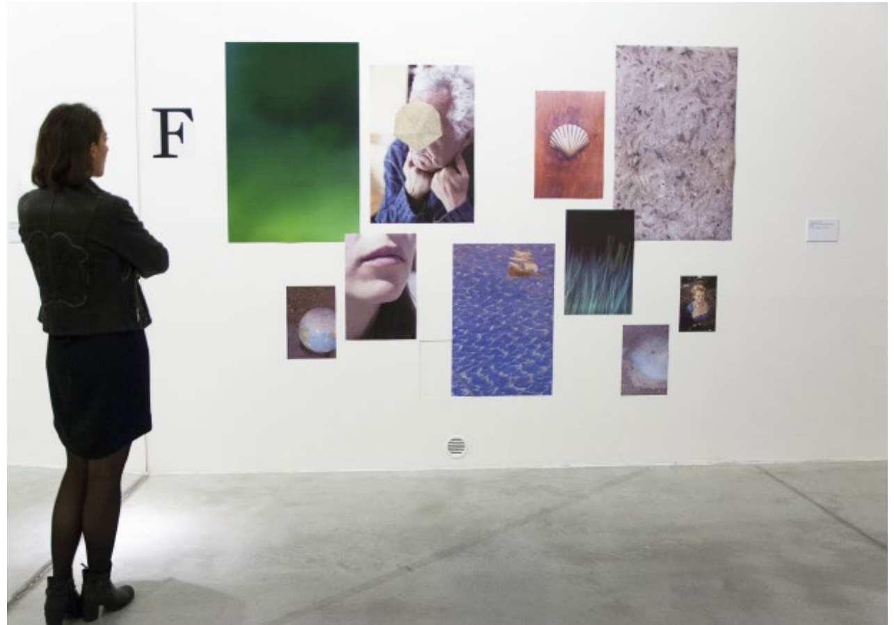
from the series Ruota, constellation from the Phlegmatic Temperament Centro Pecci per l'Arte Contemporanea, Prato, Italy, july 2017. Typographic prints, 300x180 cm.