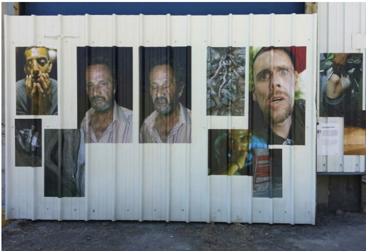
BYOpaper gallery, Papeterie Etienne, Arles, France, july 2016, opening night. Blue back typographic prints, various dimensions, 200x450 cm.

There is a kind of loneliness that everyone and everything sooner or later experiences through life. The point where one peacefully surrenders to his own weakness to investigate a new unfathomed level of consciousness. I find myself questioning about the nature of humanity and its essence. The solitary nature of man and his surroundings here stands proudly whereas the shot strikes more harshly.