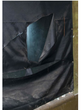
Some singular images from the project