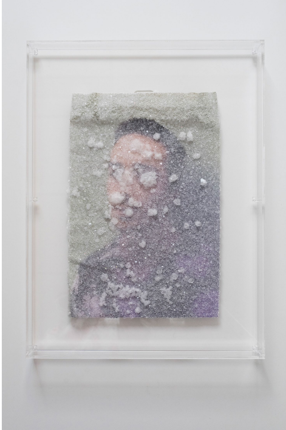
Poush, Paris, may 2023. Print on textile embedded salt crystals, plexiglass box, 35x45x5cm. Unique piece.