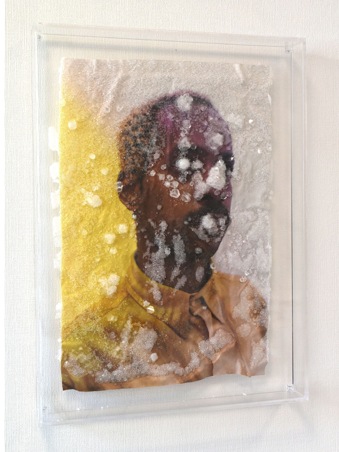
Poush, Paris, May 2023. Installation view.

Print on textile, embedded salt crystals, plexiglass box, 40x55x5cm. Unique piece.