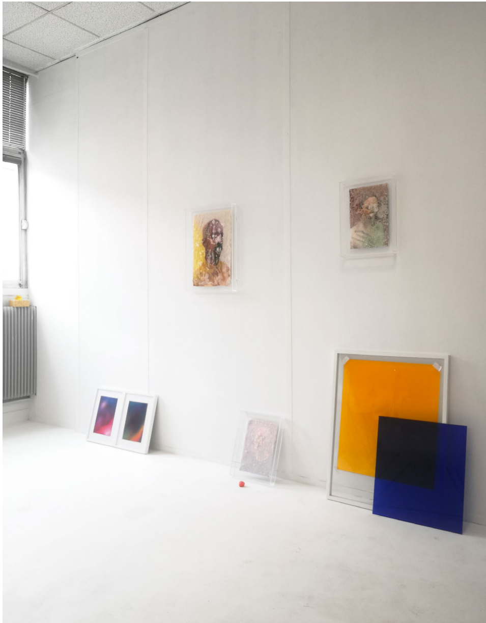
Poush, Paris, march 2023. Atelier's view. Prints on textile, embedded salt crystals, color gelatines, plexiglass boxes, fine art prints on wooden frames.