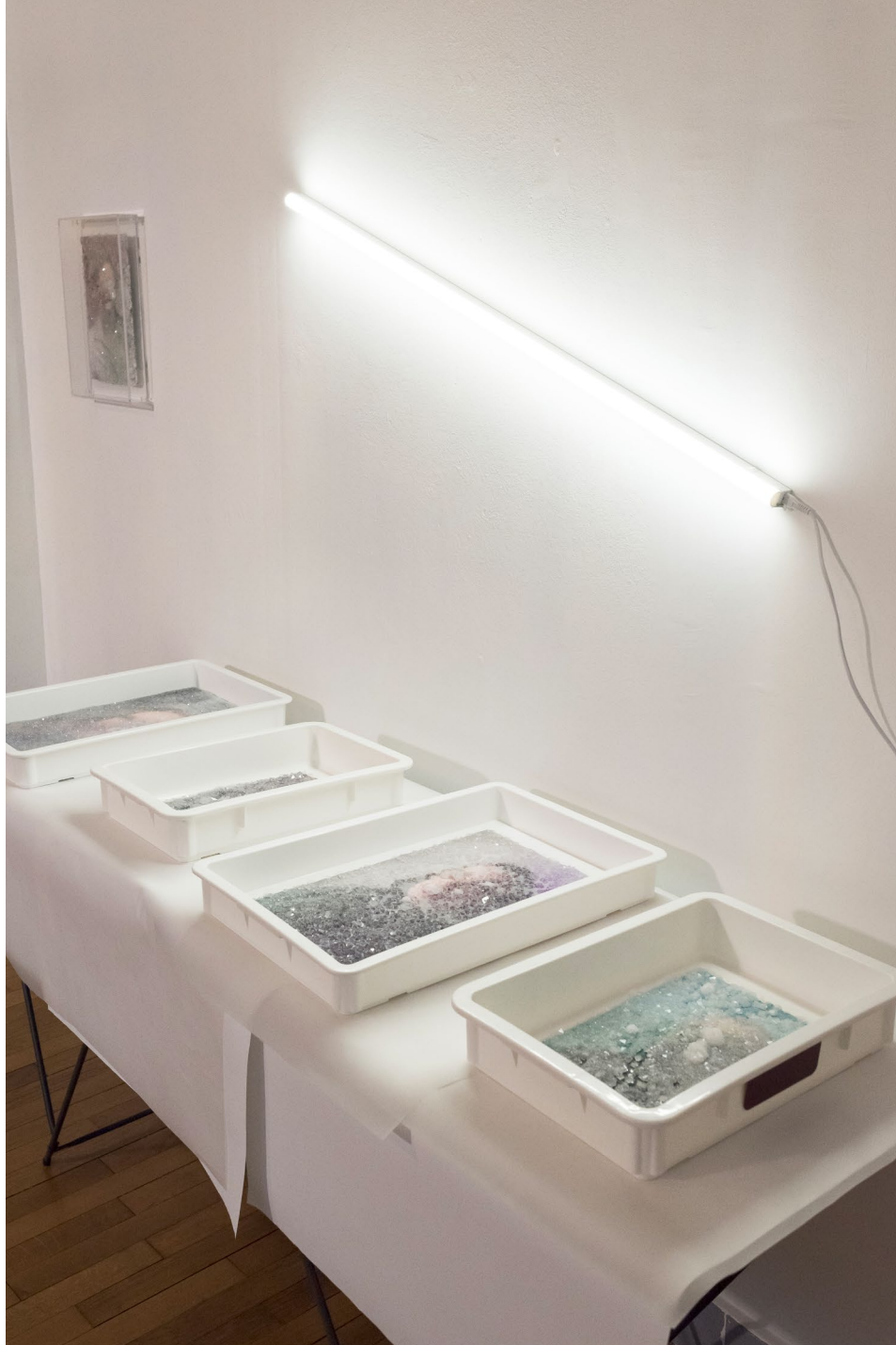
La Comete, Paris, November 2022. Variable dimension installation, Print on textile, embedded salt crystals, neon light, transparent paper.