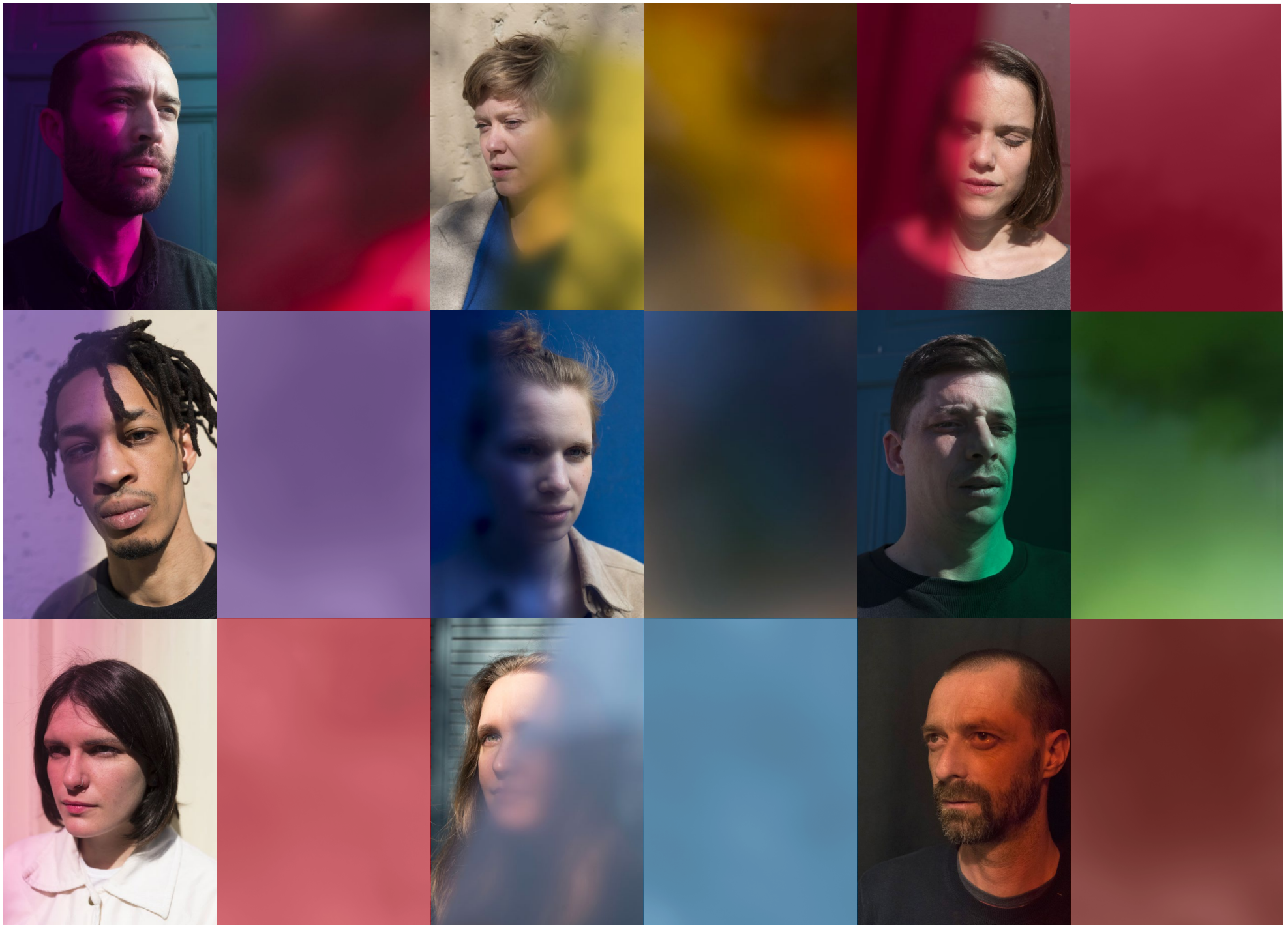
Details of the chromatic portraits. These are psychological portraits made with the help of colour filters gelatines. Each person is interpreted and translated synesthetically into a specific colour that intuitively evokes their spirit.