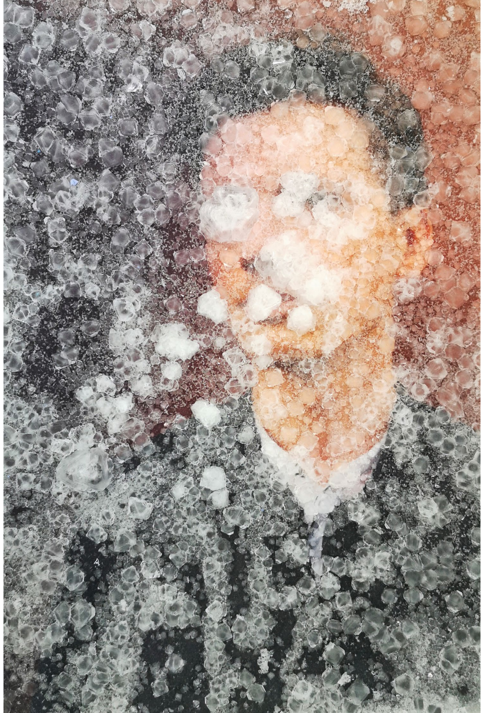
Details of the prints on fabric, salt crystals that I grow with salt directly on the prints, variable size. Unique pieces.