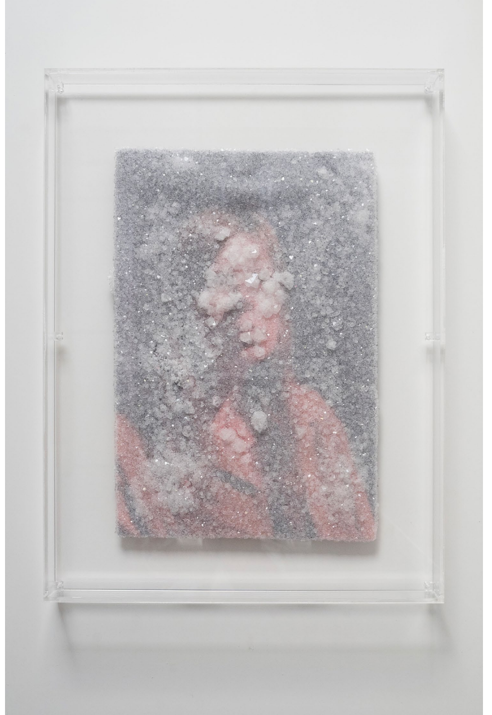
Poush, Paris, may 2023. Print on textile, embedded salt crystals, plexiglass box, 45x55x5cm. Unique piece.