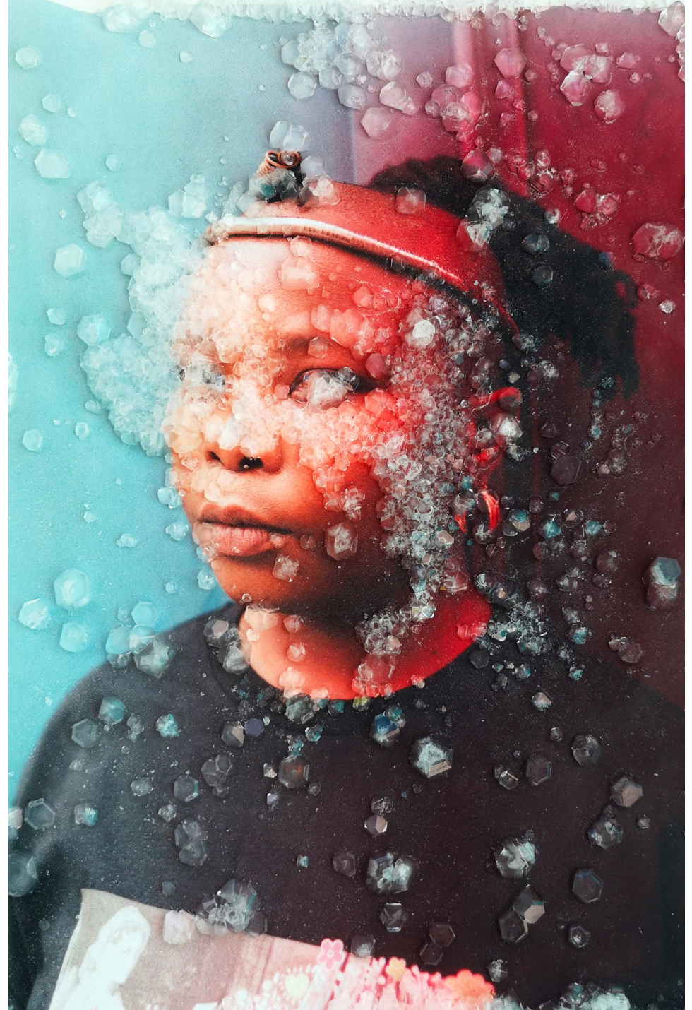
Details of the prints on fabric, salt crystals that I grow with salt directly on the prints, variable size. Unique pieces.