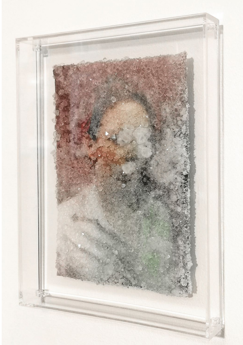
LeNeuf Sinibaldi gallery, Paris october 2022. Installation view. Print on textile, embedded salt crystals, plexiglass box, 30x40x5cm. Unique piece.