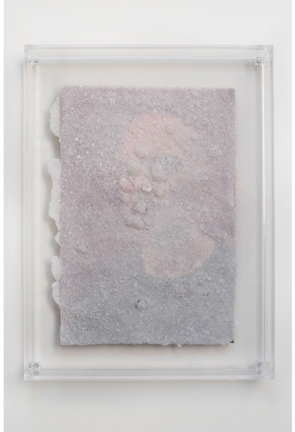
Poush, Paris, march 2023. Print on textile, embedded salt crystals, plexiglass box, 30x40x5cm. Unique piece.