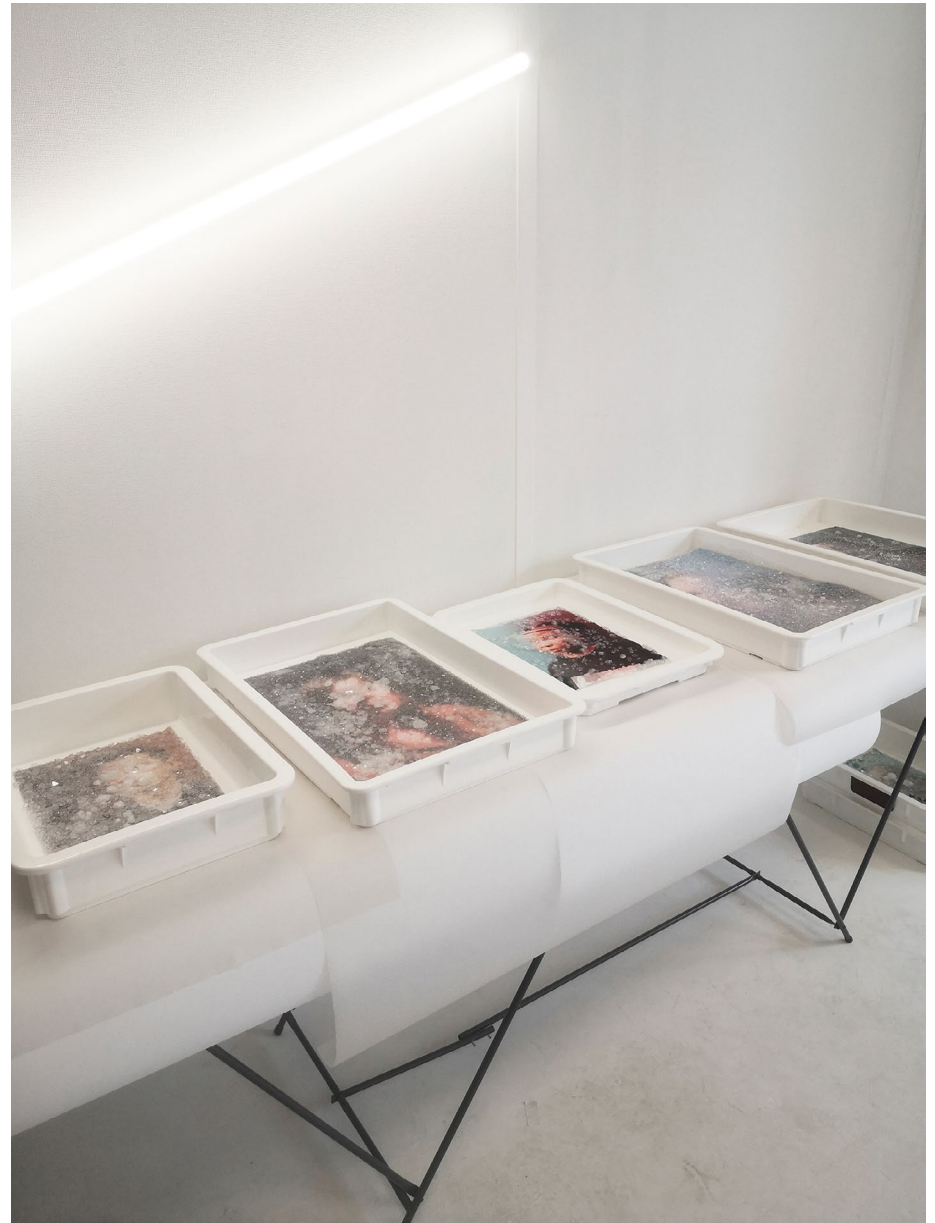
Poush, Paris, march 2023. Atelier's view. Prints on textile, embedded salt crystals, plastic containers, neon light, transparent paper, table.